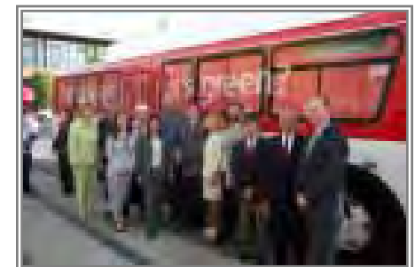
York University Shuttle