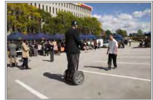
'Unlock Gridlock' fair at Enbridge