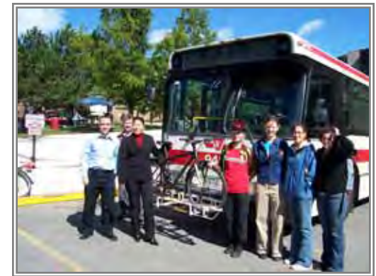
Bike event for York Community